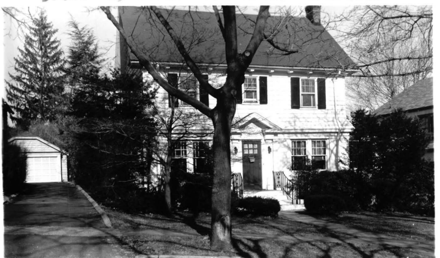
Board of Realtors of the Oranges and Maplewood